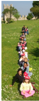
Our Little Winners

The Fundação Padre Félix works on a social development project. For this project, our team works everyday with several partners and services, including those related to areas such as education, health, youth, employment, habitation, disability, psychology, among others.