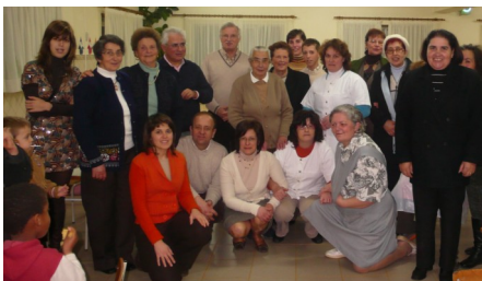
Our Team: Management, Social Worker and Volunteers