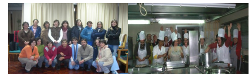
1st. Aid Care and Nutrition

Next year, we intend to offer a more diverse set of trainings, improving the knowledge already acquired by some, and training others, who are searching for a new job, helping people to do a more qualified work.